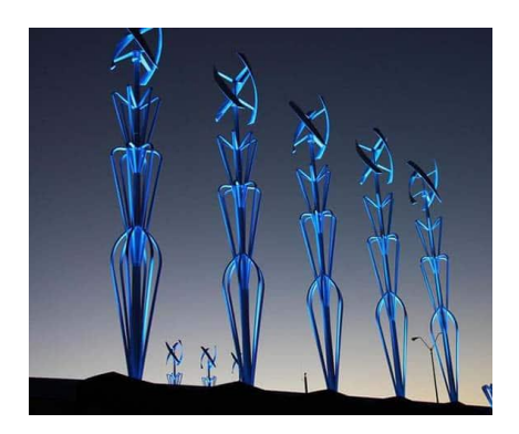
Figure 3. This installation can be found just outside El Paso airport in Texas. It consists of an array of 16 15ft vertical wind turbines. Each is lit from below with LED lights. The lights can even be programmed to celebrate the seasons or other events in the area.