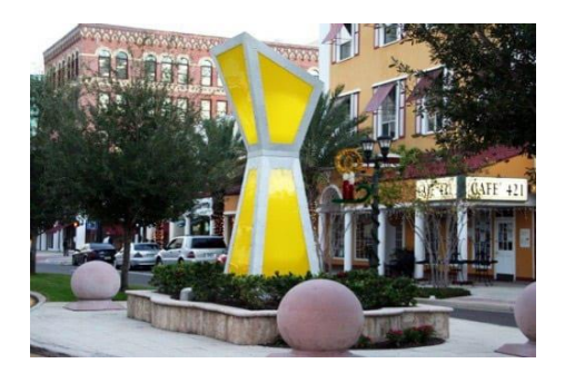
Figure 2. This 15-foot-tall solar powered piece resides in Clearwater, Florida and is a part of the city's Sculpture360 program.

Figure 1. Located at Xavier University in New Orleans, LA, this beautiful and intricate solar powered sculpture lies at the middle of campus. Its combination of industrial materials with delicate nature-inspired laser carvings shows a unique perspective on a link between technology and the natural world. The intention of the design was to replicate a seedpod coming out of a dormant state to form new life.