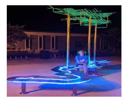
Figure 4. Solar sculpture in downtown Webster City in Iowa. The public art piece incorporates dynamic elements powered by solar energy. The sculpture was designed to reflect Webster's City's history and identity.

Figure 3. This installation can be found just outside El Paso airport in Texas. It consists of an array of 16 15ft vertical wind turbines. Each is lit from below with LED lights. The lights can even be programmed to celebrate the seasons or other events in the area.