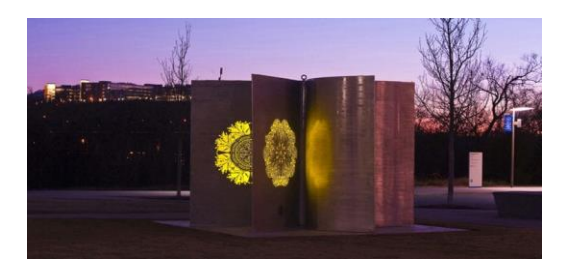
Figure 1. Located at Xavier University in New Orleans, LA, this beautiful and intricate solar powered sculpture lies at the middle of campus. Its combination of industrial materials with delicate nature-inspired laser carvings shows a unique perspective on a link between technology and the natural world. The intention of the design was to replicate a seedpod coming out of a dormant state to form new life.